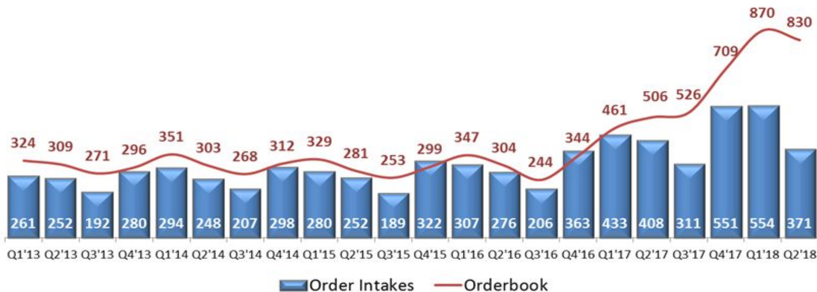
MHA & CEP en M €